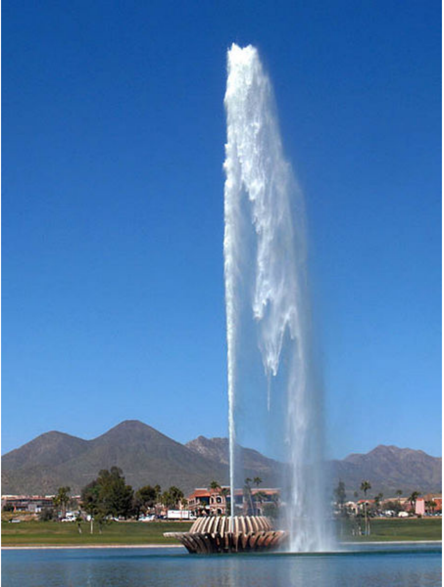
The famous Fountain Hills fountain sprays water over 550 feet into the air.