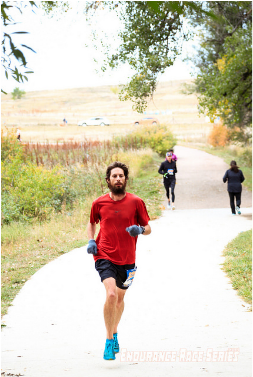
The other side of the hill