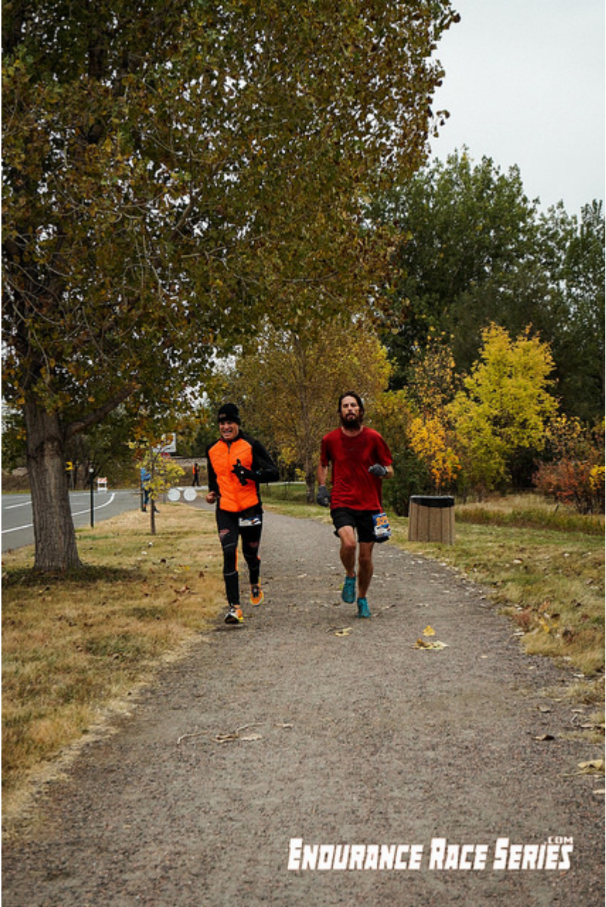
Racing to the finish